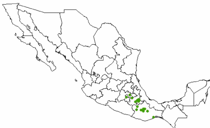
FIGURE 2. Conopsis acuta distribution map.

Distribution: Conopsis acuta is distributed in the highlands of south-central Mexico (fig. 2); it has been collected in the states of Oaxaca, Puebla, and Veracruz, from 1800 to 2600 m, in xerophilous underbrush, Opuntia (prickly pear), pine, pine-oak, and fir forests. It is usually under rocks or litter during most of the year, being more abundant in the months of August, September, and November.