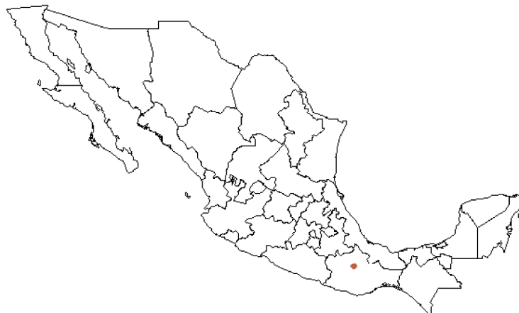
FIGURE 3. Conopsis amphisticha distribution map

Distribution: Conopsis amphisticha occurs in southern Mexico (fig. 3), in the state of Oaxaca between 1700 and 3080 m, in pine forest and oak forest, mainly, there are some records from montane cloud forest. It has been collected under rocks and logs during January, and from June to August.