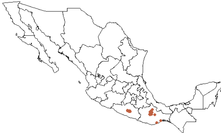
FIGURE 6. Conopsis megalodon distribution map.

to December, being more abundant from July to August.