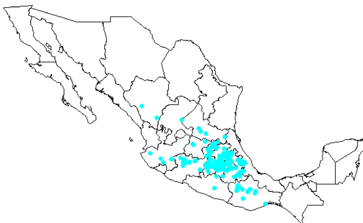
FIGURE 5. Conopsis lineata distribution map.

Distribution: Conopsis lineata is distributed in central and southern Mexico (fig. 5); it has been collected in the states of Distrito Federal, Guanajuato, Guerrero, Hidalgo, Jalisco, Estado de Mexico, Michoacan, Morelos, Oaxaca, Puebla, Queretaro, San Luis Potosi, Tlaxcala and Veracruz, from 1750 to 3100 m, in xerophilous underbrush, cactus, pine, oak, pine-oak, fir forests, and montane cloud forest. It is usually under rocks, logs, litter, grass, and in holes during the whole year; being more abundant from July to September.