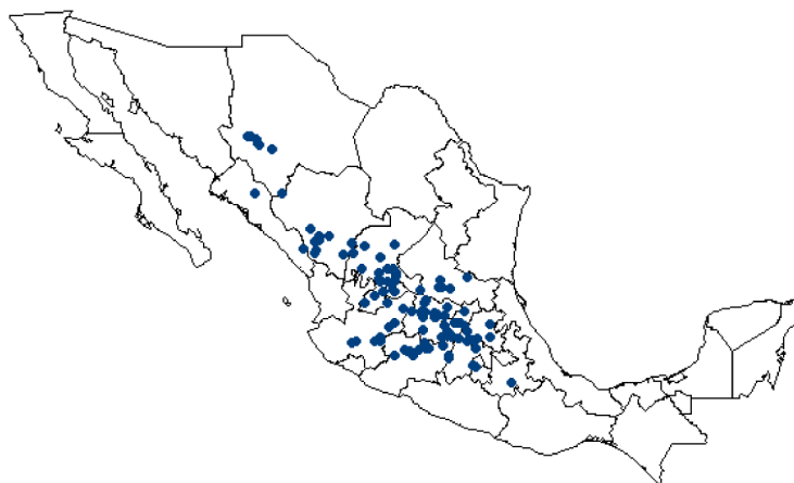
FIGURE 7. Conopsis nasus distribution map.

Distribution: Conopsis nasus is distributed in north-central Mexico (fig. 7); it has been collected in the states of Chihuahua, Aguascalientes, Distrito Federal, Durango, Guanajuato, Hidalgo, Jalisco, Estado de Mexico, Michoacan, Morelos, Puebla, Queretaro, San Luis Potosi, Sinaloa, Tlaxcala, Veracruz and Zacatecas, from 1515 to 2950 m, in xerophilous underbrush, oak, pine, and fir forest. It is usually under rocks or logs during every month of the year, being more abundant from June to September.