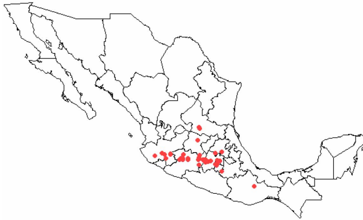
FIGURE 4. Conopsis biserialis distribution map.