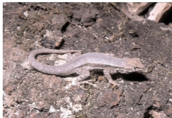
FIGURE 1. Sceloporus jalapae from Santa María Ixcatlán, Oaxaca, México.

• DIAGNOSIS. This species is one of the most distinctive of the genus, characterized by the combination of absence of postrostrals and postfemoral pockets, and presence of 17–21 femoral pores on each side. Its closest relative is S. ochoterenae , with which it forms a distinct species group as first noted by Thomas and Dixon (1976), and confirmed by Cole (1978) and Wiens and Reeder (1997). The two species share the absence of postrostrals and postfemoral pockets, but differ most conspicuously in number of femoral pores (17 or more in S. jalapae , fewer than 17 in S. ochoterenae ) and in number of dorsals (50–66 vs 38–46 from interparietal to posterior margin of thighs). There is less sexual dimorphism in dorsal pattern in S. jalapae , and the preanals are not keeled in females. The shoulder dark spots are less evident in S. jalapae , and blue streaks and dots are present on the dorsum (absent in S. ochoterenae ). Considering distribution as a character, their ranges