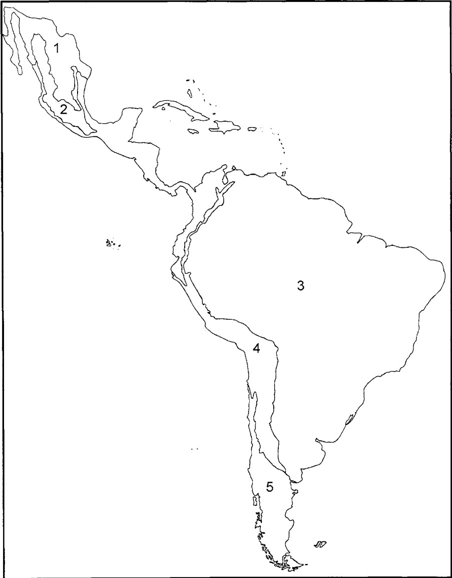
Figure 1 Biogeographic regions and transition zones of Latin America and the Caribbean islands. 1, Nearctic region; 2, Mexican transition zone; 3, Neotropical region; 4, South American transition zone; 5, Andean region.