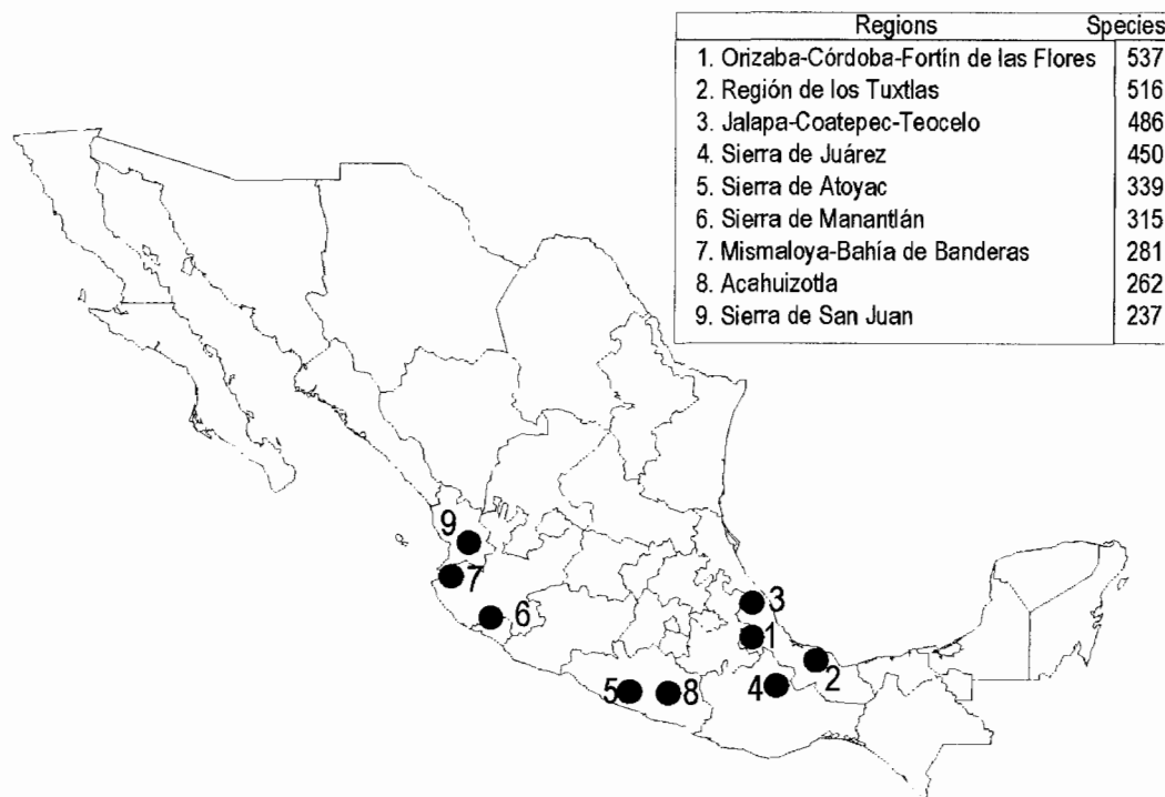
Map 2. Numbers of Papilionoidea species known from Mexico's most diverse regions. Each region includes from three to more than 30 separate collecting sites.

montane forests (especially the montane cloud forests) of central and southern Mexico. The insular distribution of the montane cloud forests along various mountain chains in Mexico has resulted in the speciation of many taxa, a phenomenon evident in many plant and animal groups (Halfiter 1987). According to Llorente (1984), there are two altitudinal barriers in Mexico which limit dispersion and generally prohibit continuous distributions of taxa: one around 600 m, and the other around 2,000 m. Each of these altitudinal barriers present dramatically different climatic and vegetational conditions. Throughout Mesoamerica, the lower altitudinal zone is composed of the tropical evergreen and semi-deciduous forests on the Atlantic slope, with tropical deciduous and semi-deciduous forests on the Pacific slope. The middle elevational zone (roughly 600–