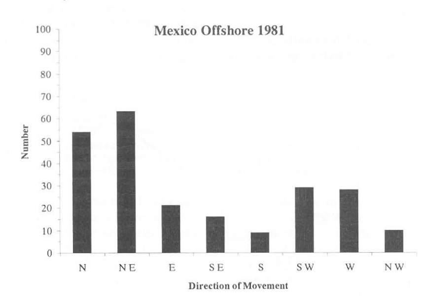
Figure 1. Distribution of pink shrimp on the Campeche Bank by direction of movement. From Klima et al., 1987.

<sup>b</sup> only 2 of the 3 nests were within the boundaries of Padre Island National Park.